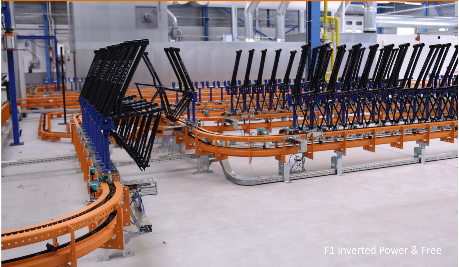
F1 Inverted Power & Free